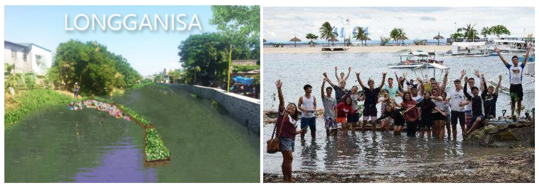
Figure 3. tangible results of international city climatescans at the Philippines. Left: the wastetrap 'longganisa' in Manila [17, 18]. Right: bio-based floating islands for water quality improvement in Cebu [19].

The delivery of tangible concrete final results is highly appreciated by stakeholders. For Rotterdam the tangible result was, among other things, an open source interactive map with climate adaptive measures (Figure 2, [16]). The City Climate Scan measurements that were conducted in other cities yielded data and insights about (plastic) waste and pollution levels in rivers and pilots about increasing the survival levels of mangrove seedlings using floating islands (Figure 3). Groningen and Rotterdam University of Applied Sciences will implement the City Climate Scans in other cities to collect data on the level of resilience and increase (international) awareness among various parties. Several City Climate Scan events are planned with cities in Indonesia (Semarang) and Philippines (Manila, Cebu), but also with various European cities.